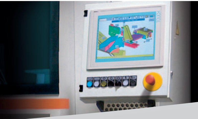
Touch screen KASTO EasyControl